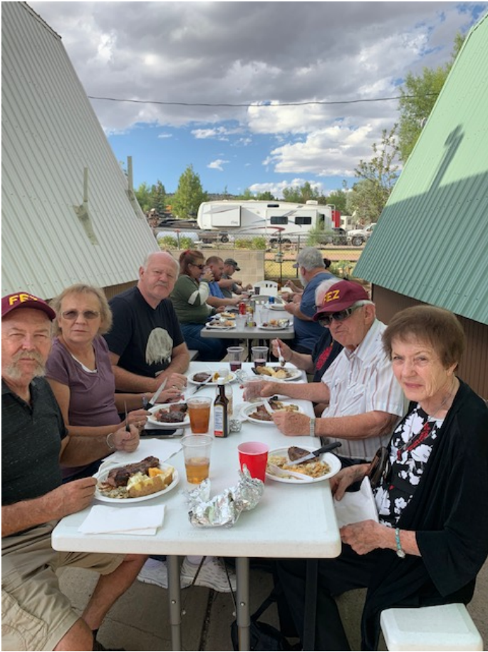
Refreshments after the Manila Dagget Daze Parade

Send Pictures of recent Shrine activities and you may see them in future issues of the Minaret.