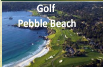
Golf Pebble Beach