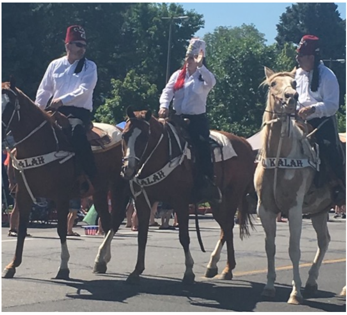
Get ready to ride!

"Dust off the míní-bíkes, shake out the clown costumes, saddle up the horses and polísh the Yellowstone bus, <u>íť s parade tíme!!!"</u>