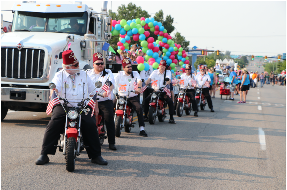
Minibikes at this year's Pioneer Days Parade in Ogden

Send in your pictures of recent Shrine parades, picnics, Club and Unit get-togethers and you might see them in the Minaret.