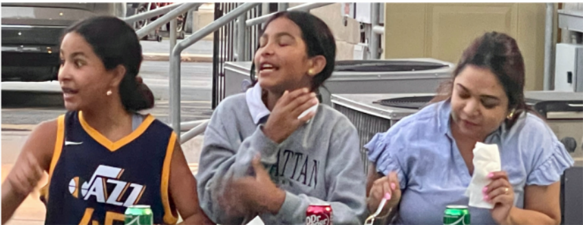
Pictures of the Shrine summer picnic, August 18 at the Salt Lake Masonic Temple

We are always looking for Shrine family pictures and videos. Send yours to jsweetinogden2@yahoo.com and you may see them in the Minaret.