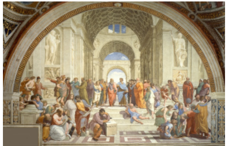
Raphael portrays philosophers up to that time aligning to the side of Plato (Wisdom) or Aristotle (Strength.)

Despite this heavy leaning towards Strength, Nietzsche does praise Greek Gods. Dionysian passions in man require "Superman" Strength to control them, instead of suppressing them. He dubs this balance HEALTH, another word for Balance. Human foibles must be acknowledged instead of repressed, "for there is no opposition between chastity and sensuality." The Craft highlights this point each time we open a lodge of Entered Apprentices.