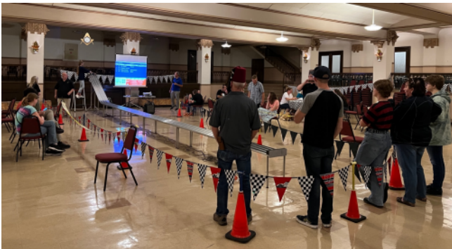
El Kalah Shriners Pinewood Derby, September 21