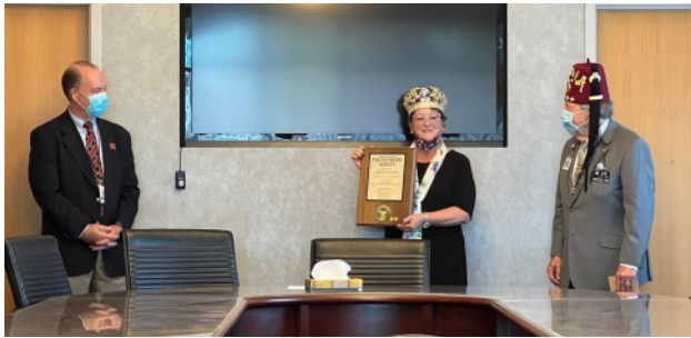
Awards Ceremony at Shriners Children's commemorating three million dollar donation from Daughters of the Nile, Foundation, September 20