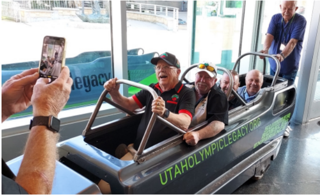
Western Area Organized Unit Meet, Companions Program, September 10