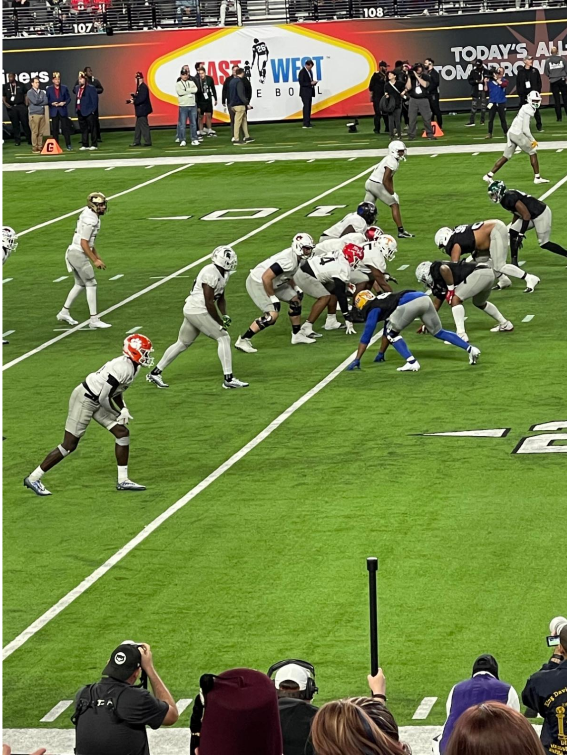
Several El Kalah Shriners and their ladies and Shriners Children's Salt Lake staff traveled to Las Vegas to attend the Shrine East/West Bowl football game February second.