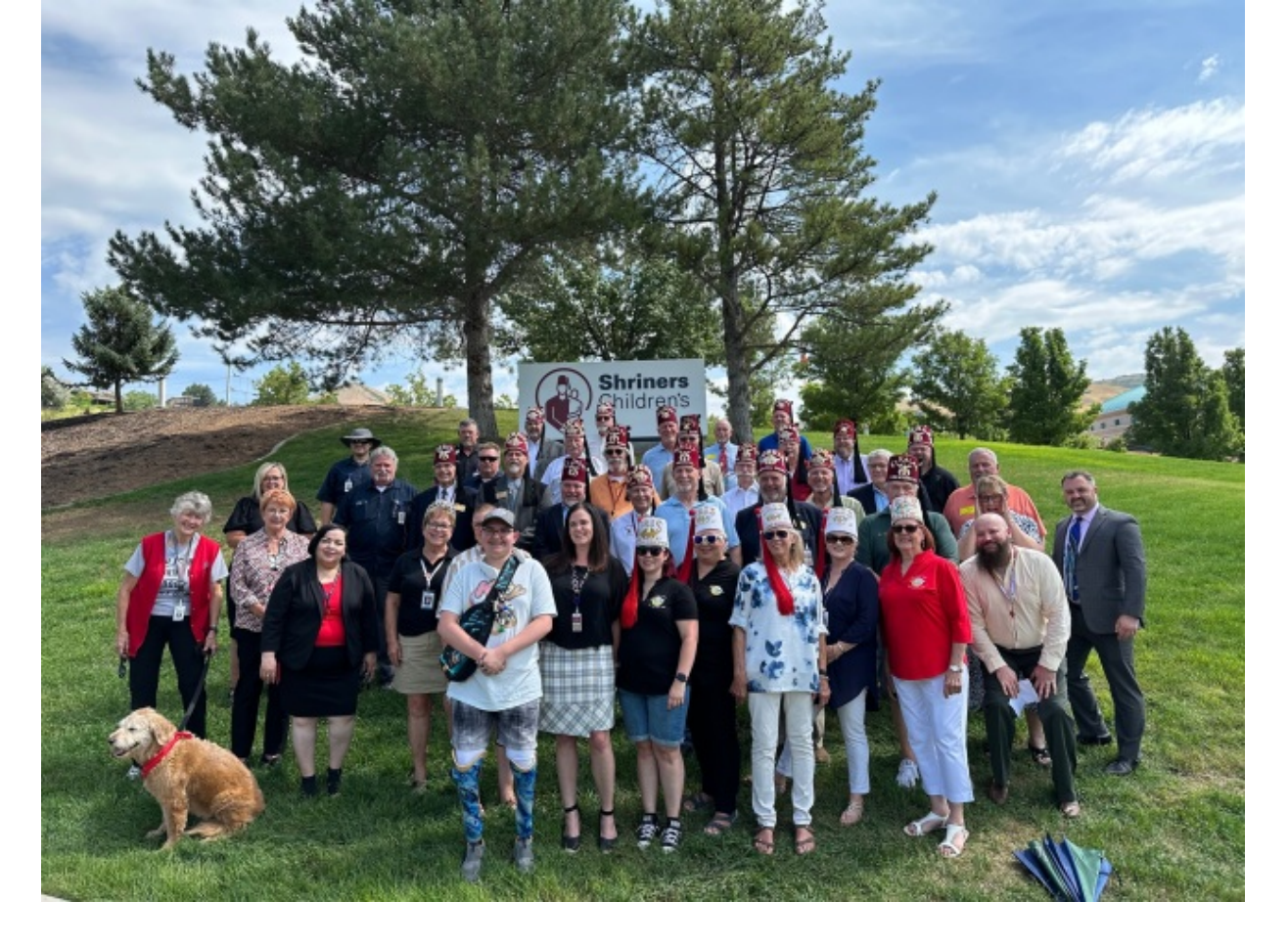
Shriners Hospital for Children, Salt Lake City is now Shriners Children's. The rebranding ceremony of the former hospital now Clinic was held on July 31.