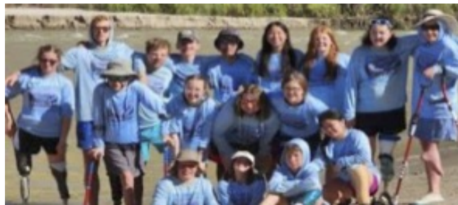
2023 Summer Un-Limb-ited Camp